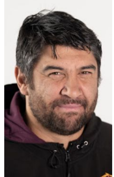
Te Iwi Ngaro Wairau - HSPP